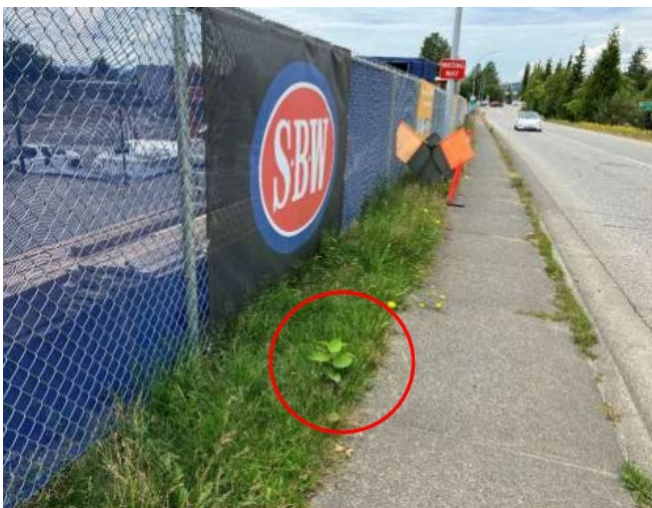
Japanese Knotweed identification – Group 2