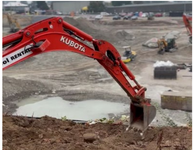
Removal of Group 1 via excavator under controlled conditions