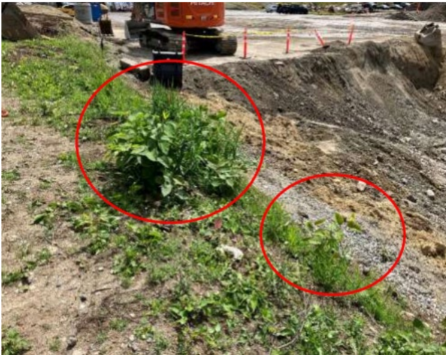
Japanese Knotweed identification – Group 1